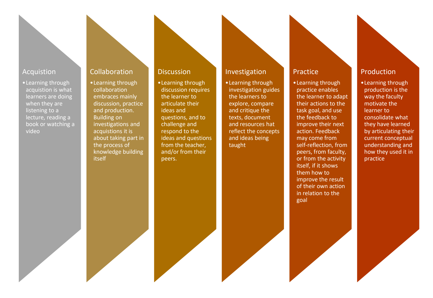
Figure 3: Models of learning, adapted from Young & Perović, ABC Learning Desgin (2020)

Laurillad explains that the learning types approach are 'derived from conceptual learning, experiential learning, social constructivism, constructionism, and collaborative learning, and the corresponding principles for designing teaching and learning activities in the constructional design literature' (2012, p. 93). The 6 learning types are outlined in the graphic below in figure 3.